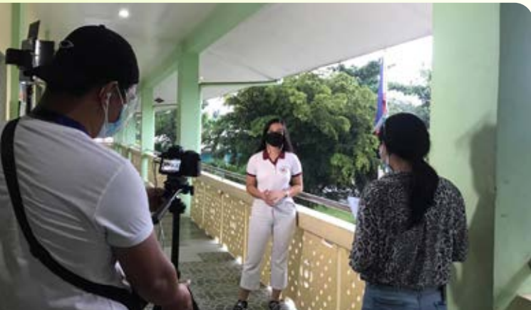
Filming relating to the topic of children's protection

of former recycling collectors (Community Based Programs and Services).