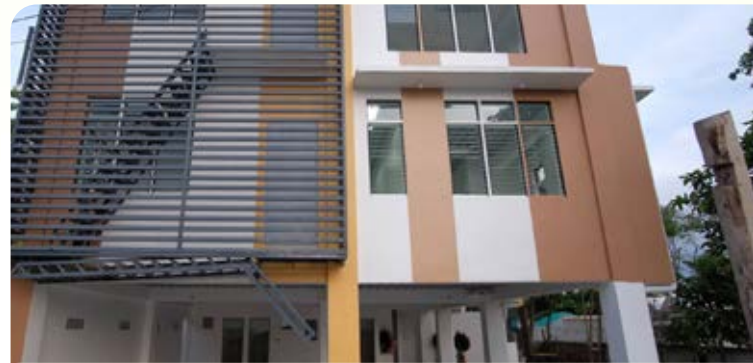
Alice Rose Clover Child Development Center.

Not yet finished is the ground level where a coffee shop, a bakery and a grocery will be opened.