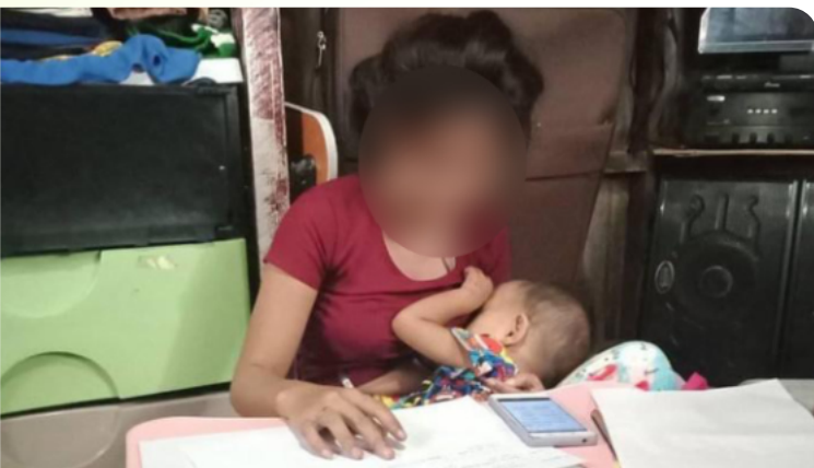
A chance for teenage mothers

Teaching with modules had clear disadvantages compared with normal teaching, and it meant a huge challenge for most students. Though for some, this method of teaching was an opportunity, to be specific, for the teenage mothers. During the pandemic, several of them resumed education, because they did not have to be present in classrooms, but could learn at home while looking after the children.