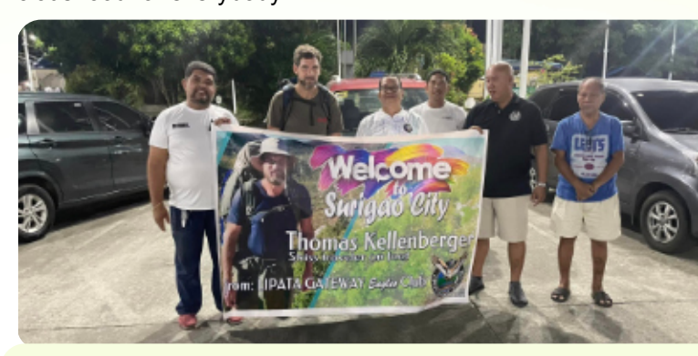
A warm "Welcome" at Surigao City.

and burst into tears. Later, he said that this moment was one of the happiest in his life. After a prayer of gratitude in the form of dance and more speeches on the festively decorated square, a big celebration started with delicious food for everybody.