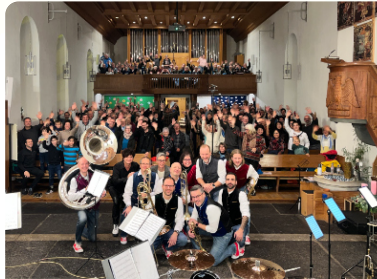
BRASSmeetsVOCALS, Signau 2023

The "Gendarmen" with "Quattro Schatzjoni" started the well attended charity events from the end of 2023 to the beginning of 2024. A "schöne Zeit" (wonderful time) is guaranteed when visiting their Christmas concerts on "Some Nights" in December. Already for the 7th time the