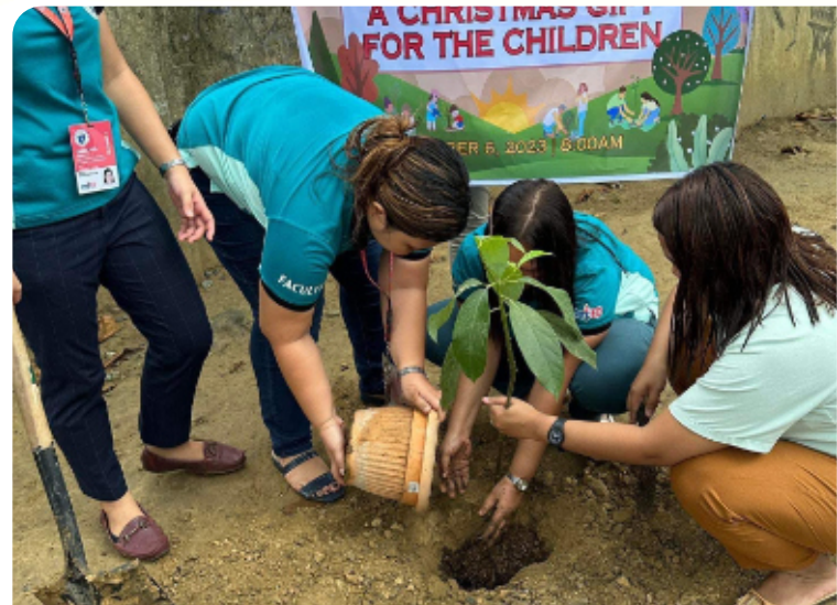
Planting trees during activities of PIKIFI.