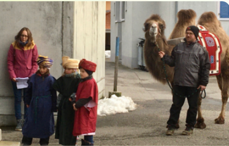
Christmas celebration in Hasle-Rüegsau.

A touching event with wow-effects was the Christmas celebration in Hasle-Rüegsau where visitors wandered from place to place. The collection again was donated for our work.