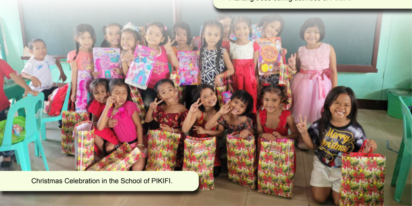
Christmas Celebration in the School of PIKIFI.